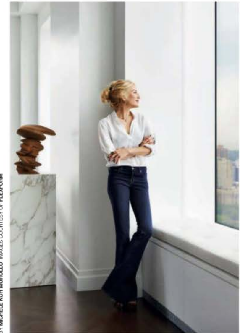
BY MICHELE KOH MOROLLO

USING ITS OWNER'S ART COLLECTION AS ITS GUIDING COMPASS, THIS PENTHOUSE MARRIES THE FORMAL ELEGANCE OF A MUSEUM WITH THE URBAN GLAMOUR OF THE BIG APPLE