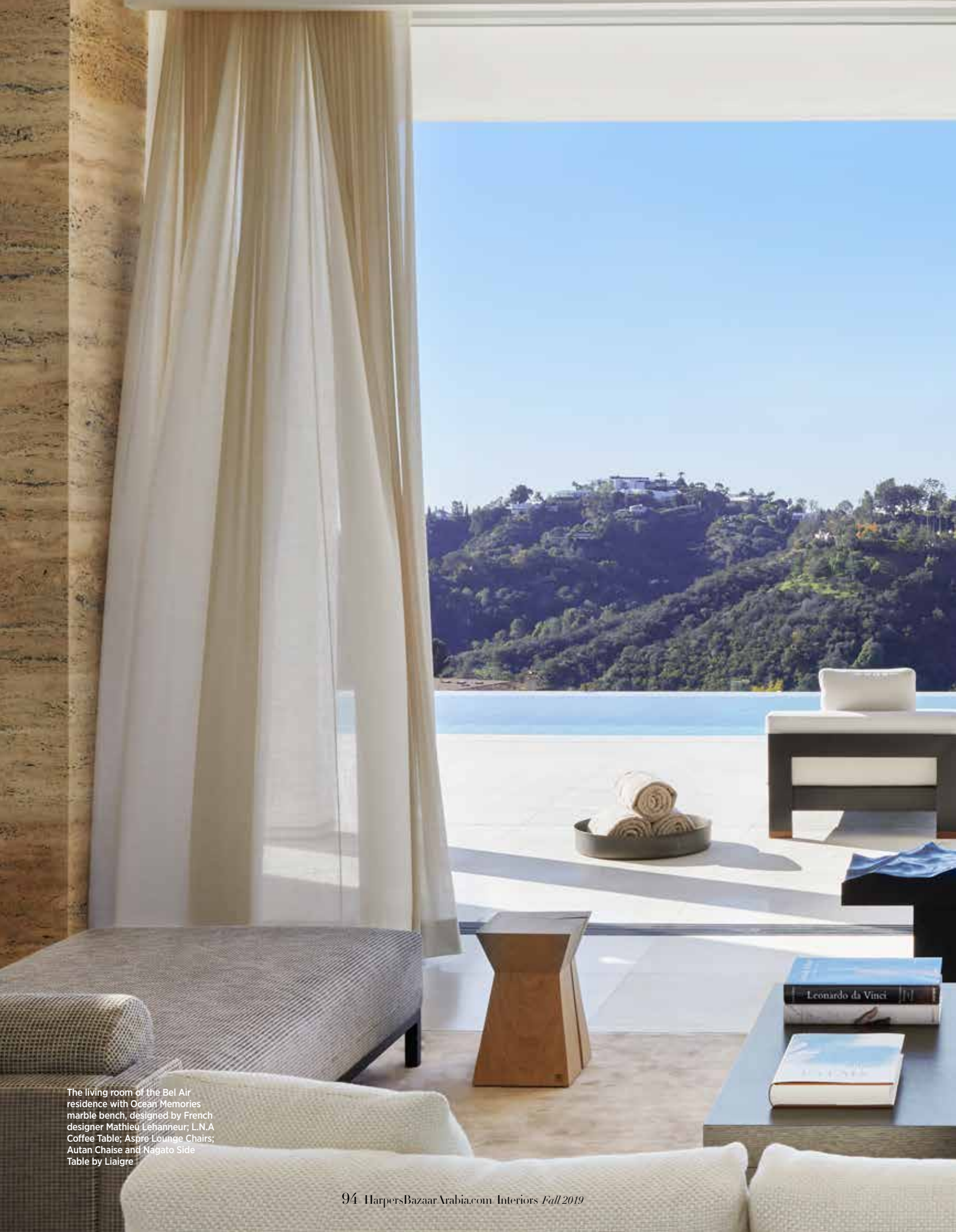
The living room of the Bel Air residence with Ocean Memories marble bench, designed by French designer Mathieu Lehanneur; L.N.A Coffee Table; Aspre Lounge Chairs; Autan Chaise and Nagato Side Table by Liaigre